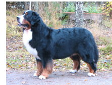
FICH SUCH RICCARRON KROISOSPENNONEN FIN43423/03 | 2003 - 2013 | BG#47023 HD-C/C ED-0/0