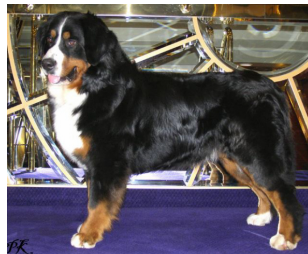
EE CH LV CH RIDON HENNET BISTRITA EST-03117/05 | 2005 - | BG#55732 HD-A/A ED-0/0

WS06409902 | 2003 - 2015 | BG#32182 OFA/H-G OFA/EL CERF CARD vWD DM