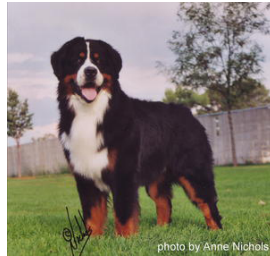
CH TI GUS SEN DE LA BUTTE LS774243 | 2001 - 2009 | BG#36978 OFA/H-G OFA/EL CERF CARD vWD