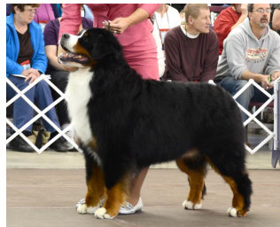
GCH FICH BLUMOON TANZENITE V BLACKROCK WS18117701 | 2006 - 2017 | BG#46558 OFA/H-G OFA/EL CERF CARD vWD DM

WP75968802 | 1997 - 2009 | BG#16715 GDC/H-G GDC/EL