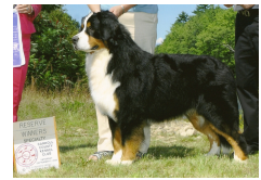
CH PEACEFIELD'S LEGACY V WOODMOOR WS21966901 | 2007 - 2013 | BG#57895 OFA/H-G OFA/EL CERF CARD vWD