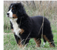
ZAHARA ZOE AV HISELFOSS LOE 1785023 | 2007 - 2018 | BG#56709 DM