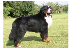
DT CH LUX CH VDH CH BJARNE VD ENTENGASSE SSV-BS 46903 | 2005 - 2015 | BG#71779 HD-FREI ED-NORMAL DM