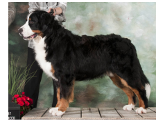
Can CH BARNUM DU BOIS D'ORLIA 693115 | 2010 - 2020 | BG#82280 OFA/H-G OFA/EL CERF CARD vWD