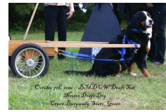
COPEs BURGUNDY STARR WS10635003 | 2004 - 2009 | BG#26499 OFA/H-G OFA/EL CERF VWD