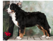
Can CH BARNUM DU BOIS D'ORLIA 693115 | 2010 - 2020 | BG#82280 OFA/H-G OFA/EL CERF CARD vWD DM