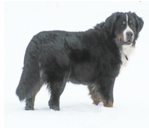
CH OLEKAS KENTUCKY SKY WS23509901 | 2007 - 2018 | BG#57851 OFA/H-G OFA/EL CERF CARD vWD DM