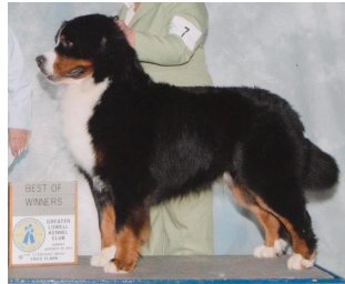
Am/Can CH SENNENHOF RIGI KULM YL410550 | 2011 - 2019 | BG#80187 OFA/H-G EYES CARD vWD

Sex: M Reg#: WS55701201 (AKC), 1135662 (CKC)