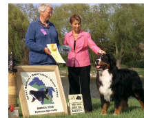
Am/Can CH TSCHUGGEN V SENNENHOF WR07661305 | 2002 - 2011 | BG#19931 OFA/H-E OFA/EL CERF CARD vWD