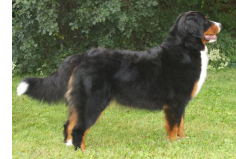
Can CH ADESA MAPLE BUTTER V SENNENHOF WS19194907 | 2006 - 2018 | BG#44368 OFA/H-E OFA/EL CERF CARD