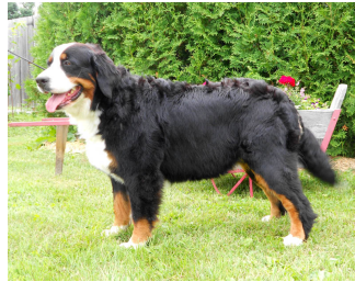
AJOIE D'IMIER ZA450658 | 2012 - | BG#88546 OFA/H-G OFA/EL EYES CARD vWD