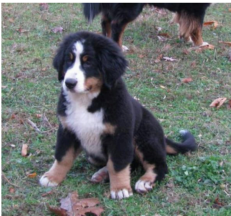
DAM: OLEKAS VONNIE V TRAVERSE HILL WS48278201 | 2014 - 2022 | BG#115224 OFA/H-G OFA/EL CARD