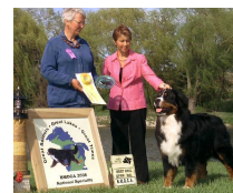
Am/Can CH TSCHUGGEN V SENNENHOF WR07661305 | 2002 - 2011 | BG#19931 OFA/H-E OFA/EL CERF CARD vWD