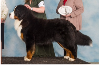
SIRE: CH IMIER PILATUS V SENNENHOF CE601491 | 2015 - 2021 | BG#123123 OFA/H-G OFA/EL CARD vWD DM