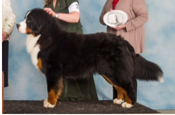
SIRE: CH IMIER PILATUS V SENNENHOF CE601491 | 2015 - 2021 | BG#123123 OFA/H-G OFA/EL CARD vWD DM