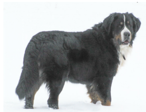
CH OLEKAS KENTUCKY SKY WS23509901 | 2007 - 2018 | BG#57851 OFA/H-G OFA/EL CERF CARD vWD