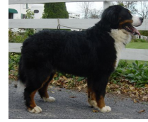
HELD VOM COLMBERG WALDCHEN WS31990401 | 2009 - 2018 | BG#72711 OFA/H-E OFA/EL CERF