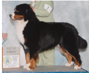
Am/Can CH SENNENHOF RIGI KULM YL410550 | 2011 - 2019 | BG#80187 OFA/H-G EYES CARD vWD DM

Sex: M Reg#: WS55701201 (AKC), 1135662 (CKC)