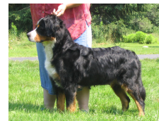
NASHEMS AMSTEL NOT SO LIGHT WS07627803 | 2004 - 2014 | BG#31995 OFA/H-E OFA/EL CERF