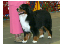
Am/Can CH PEACEFIELD FLASHBACK V DRAGON WS00384301 | 2001 - 2007 | BG#36976 OFA/H-E OFA/EL CARD