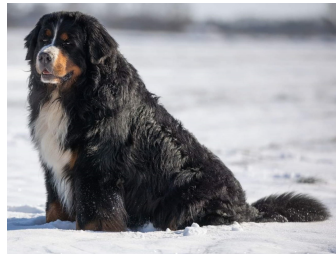
CIB FICH HR CH JCH JCH JCH LUX CH NL CH GEORGEIOUS MC. GREY VOM RUMMELSBACH NHSB 2875813 | 2011 - 2022 | BG#87794 HD A ED-VRIJ