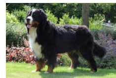
KRONBLOMMAS MACBETH LOSH 9133003 | 2010 - 2019 | BG#82836 HD-SSV-PEDIGREE SSV-PEDIGREE