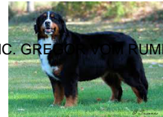
CIB FICH OEST CH VDH CH MAROUSSIA ESPRIT FIN10621/06 | 2005 - 2013 | BG#61612 HD-A/B ED-0/1 (LEFT: NORMAL - RIGHT: GRADE 1)