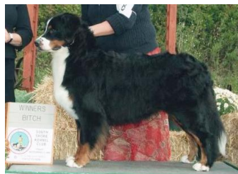
CRIMSON HARVEST'S AUTUMN SUNSET WS19626901 | 2006 - 2015 | BG#45181 OFA/H-G OFA/EL CARD DM