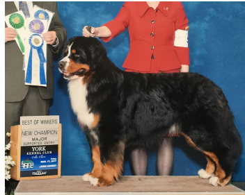
SIRE: Am/Can CH SUPER MINI MACCIE VOM RUMMELSBACH WS52060001 | 2015 - | BG#124713 OFA/H-G OFA/EL EYES CARD vWD

DOB: Jan 9, 2017 - Sex: F Reg#: WS55786502 (AKC), 1142702 (CKC) Owner: LLOYD JONES & LYNN JONES Cert/Test: OFA/H-F OFA/EL BG#140297