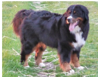
MORGANNA PRINSES VOM RUMMELSBACH SSV BS 57114 | 2013 - 2022 | BG#124712