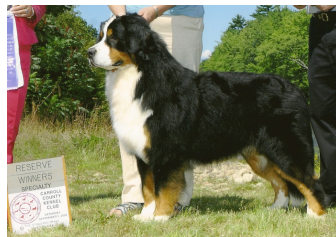
CH PEACEFIELD'S LEGACY V WOODMOOR WS21966901 | 2007 - 2013 | BG#57895 OFA/H-G OFA/EL CERF CARD vWD