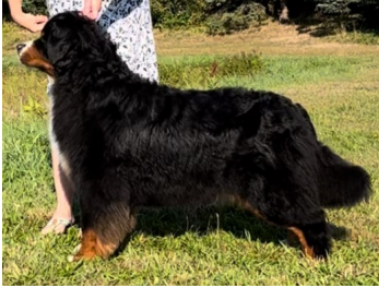
SIRE: Am/Can CH SUPER MINI MACCIE VOM RUMMELSBACH WS52060001 | 2015 - | BG#124713 OFA/H-G OFA/EL EYES CARD vWD DM

DOB: Jan 9, 2017 - Sex: F Reg#: WS55786502 (AKC), 1142702 (CKC) Owner: LLOYD JONES & LYNN JONES Cert/Test: OFA/H-F OFA/EL BG#140297