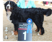
FAMOUS BENN V D. BUUT VRIJ HOEVE NHSB 2638360 | 2007 - 2018 | BG#87046 HD A ED 0