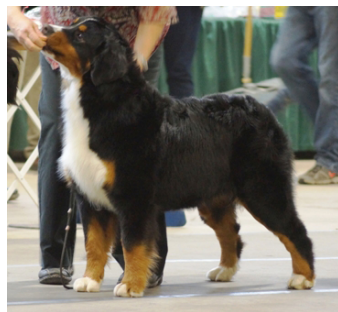
DAM: CRIMSON HARVEST'S SOLE INSPIRATION WS42229701 | 2012 - 2017 | BG#90558 OFA/H-G OFA/EL CARD DM