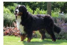
KRONBLOMMAS MACBETH LOSH 9133003 | 2010 - 2019 | BG#82836 HD-SSV-PEDIGREE SSV-PEDIGREE