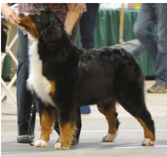
DAM: CRIMSON HARVEST'S SOLE INSPIRATION WS42229701 | 2012 - 2017 | BG#90558 OFA/H-G OFA/EL CARD DM