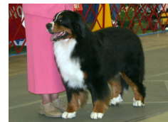
Am/Can CH PEACEFIELD FLASHBACK V DRAGON WS00384301 | 2001 - 2007 | BG#36976 OFA/H-E OFA/EL CARD