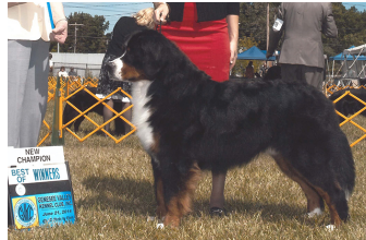
CH ARUNDEL'S STROKE OF LUCK V NASHEM WS41733504 | 2012 - 2019 | BG#94379 OFA/H-G OFA/EL EYES CARD vWD