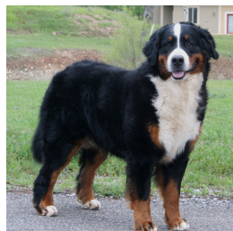
CH BERTIERS SUNSHINE BOSS WS36171701 | 2010 - | BG#78537 OFA/H-G OFA/EL CERF CARD vWD DM