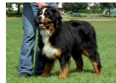
OEST CH XANDER'S HILL HAPPY MET.BSH.8395/05 | 2005 - | BG#66762 HD A ED-NORMAL