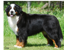
DK CH FICH IT CH NO UCH NORD CH SUCH ODYSSEUS S54697/2006 | 2006 - 2015 | BG#68645 HD GRAD A ED UA (0) DM