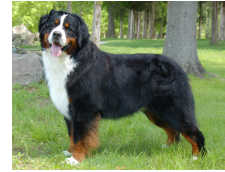
GCH ARUNDEL'S DIEZEL'S NOBODY'S FOOL WS30806001 | 2009 - 2018 | BG#75611 OFA/H-E OFA/EL EYES CARD vWD