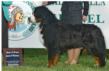
SIRE: CH ARUNDEL YES YOU STOLE MY HEART AT HAPI MTN WS45067703 | 2013 - 2019 | BG#109337 OFA/H-F OFA/EL EYES CARD vWD