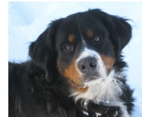
ARUNDEL HANNAH LALITHA MAISIE WS26622501 | 2008 - 2016 | BG#77637 OFA/H-F OFA/EL CERF CARD vWD