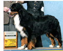
Am/Can CH MONCHSBERGS KITZBUHEL WS28053002 | 2008 - 2018 | BG#62251 OFA/H-G OFA/EL EYES CARD vWD DM