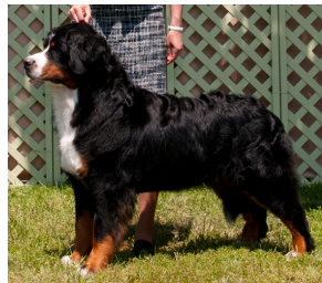
CH ARUNDEL'S STARLIGHT SERENADE WS37321901 | 2011 - 2019 | BG#85197 OFA/H-G OFA/EL EYES CARD vWD