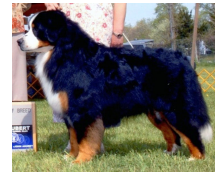
GCH INT CH LATAM CH PANAM CH PR CH STEADFAST ADELSTAMM CHE WS11127901 | 2004 - 2013 | BG#29082 OFA/H-G OFA/EL CERF CARD vWD DM