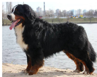
MD CH SENNENLAND'S GRAND CANYON MET.BSH.624/12 | 2012 - | BG#118479 HD A ED 00