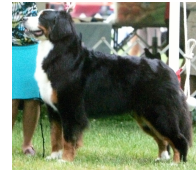
CH ADESA CASTLEMTN MS AMERICAN PIE WS14969501 | 2005 - 2017 | BG#42467 OFA/H-G OFA/EL CERF CARD DM