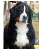
JCH RUS CH TERRA DE BERN SHARLOTTA RFK 2698255 | 2010 - | BG#102140 HD A ED 0/0