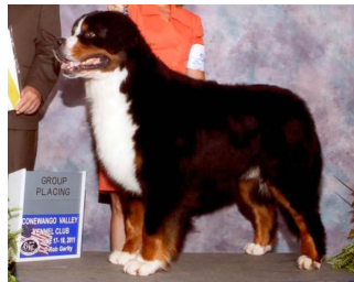
GCH ADESA BATTLESHIP DEFENDER WS26003903 | 2008 - 2017 | BG#59646 OFA/H-G OFA/EL CERF CARD vWD DM