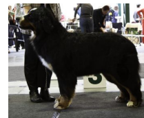
SENNENLAND'S FIGHT FIRE WITH FIRE EST-01644/10 | 2009 - | BG#71111 HD 0 ED 0 DM