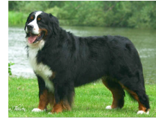
Am/Can CH AUST CH NL CH SUCH ZANZEBERN DEFENDER ANKC 2100198936 | 2004 - 2013 | BG#53122 OFA/H-E OFA/EL CERF CARD vWD DM