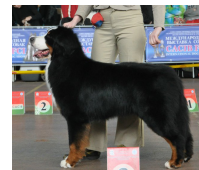
BY CH RKF CH RUS CH DOREMIS MAGELLAN SWUB SE65090/2010 | 2010 - 2019 | BG#99105 HD: A ED: 0