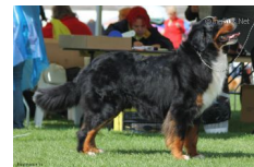
RIDON HENNET JAZZ EST-04146/11 | 2011 - | BG#83671 HD A/A ED 0/0 DM