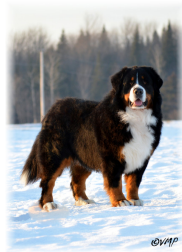
Can CH BELNOIS READY TO RUMBLE ZA450064 | 2012 - 2022 | BG#99087 PennHIP CERF CARD vWD DM