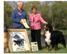
Am/Can CH TSCHUGGEN V SENNENHOF WR07661305 | 2002 - 2011 | BG#19931 OFA/H-E OFA/EL CERF CARD vWD