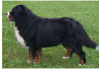
YUPP V COLMBERG WÄLDCHEN 1088318 | 2003 - 2012 | BG#30597 OFA/H-G OFA/EL CERF CARD vWD