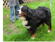
LISSY VOM BERGFELDER LAND SSV-BS 48475 | 2006 - | BG#68943 HD-FREI ED-NORMAL