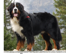
DT CH ROJAN VD HOLDERSTOCKHÖHE SSV-BS 47355 | 2006 - | BG#59434 HD A/A ED-NORMAL