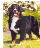
Can CH SENNENHOF XOEE GL437489 | 1997 - | BG#16169 GDC/H-G GDC/EL CERF