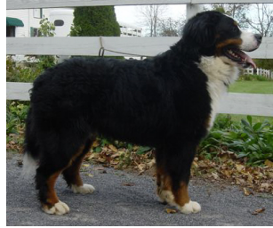
HELD VOM COLMBERG WALDCHEN WS31990401 | 2009 - 2018 | BG#72711 OFA/H-E OFA/EL CERF