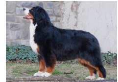
GCH ADESA POLITICALY CORRECT CASMOR WS03188303 | 2003 - 2015 | BG#21170 OFA/H-G OFA/EL CARD