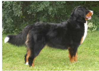
Can CH ADESA MAPLE BUTTER V SENNENHOF WS19194907 | 2006 - 2018 | BG#44368 OFA/H-E OFA/EL CERF CARD