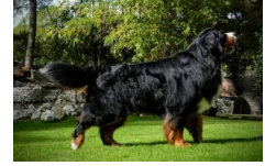
ASLAN REALCLASS LOE 2086832 | 2012 - | BG#153569