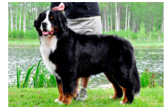
BERNERDALENS JACKPOT SE17708/2011 | 2011 - 2018 | BG#86480 HD GRAD A ED UA (0)