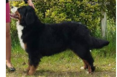
GLAMOUR SOPHIE FROM CHRISTOF LAND CMKU/BSP/10324/13 | 2013 - | BG#112726 HD-3+7=10 ED 0/0 WVD

SIRE: HIP-HOP YANDEX WS70385101 | 2019 - | BG#206025 OFA/H-E OFA/EL