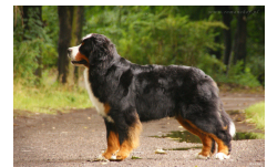
BALKAN CH BG CH CH CIB GR CH JCH JCH MD CH RO CH RUS CH LET'S PKR.II-119336 | 2014 - | BG#116386 HD-L.P. 1471/2015 (A) ED-L.P. 1471/2015 (0) CARD