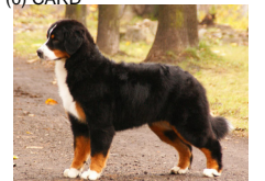
AZ CH BALKAN CH BG CH CR CH CY CH GE CH GR CH JCH JCH JCH JCH PKR.II-113364 | 2012 - 2018 | BG#99045 HD A ED 0 EYES CARD vWD DM