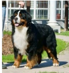
MAJOR DE NÉBOA DE MEIGAS RKF 4595648 | 2015 - | BG#154489